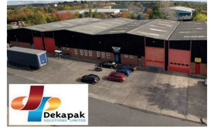
They took the decision to move into the production of its own brands 'Candy Makers' and 'Absolutely Free From' to satisfy increasing demand in the sugar free and 'Free From' sectors and we were able to support them with a funding solution

Dekapak Solutions provides contract packing, manufacturing, warehousing and distribution facilities and boasts an impressive client list